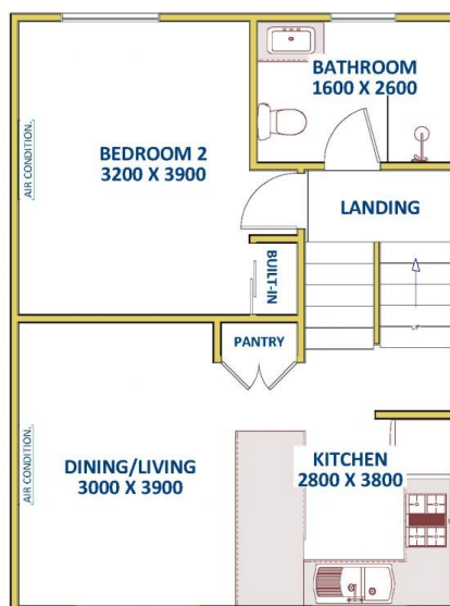
First Level +