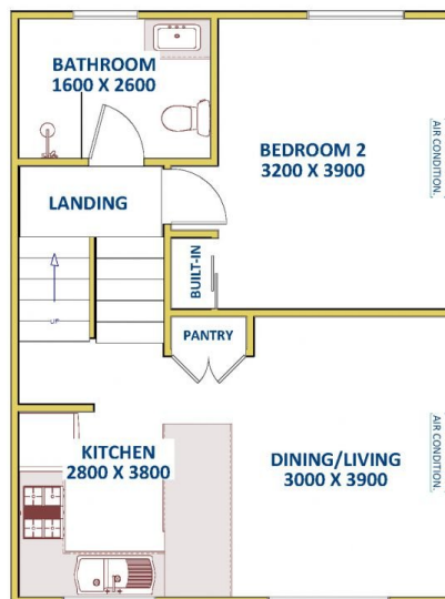
First Level +