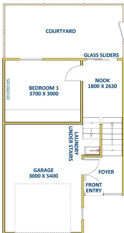
Ground Level +

This drawing has been prepared for marketing purposes. Dimensions are a guide only.