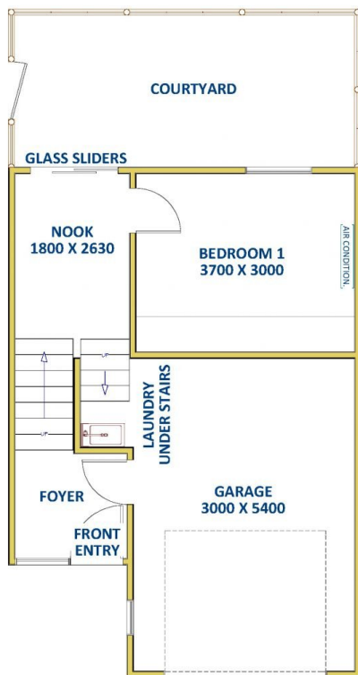
Ground Level +