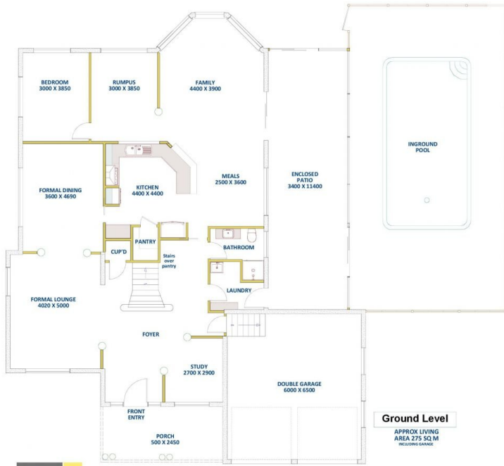
111 Birchgrove Drive, WALLSEND